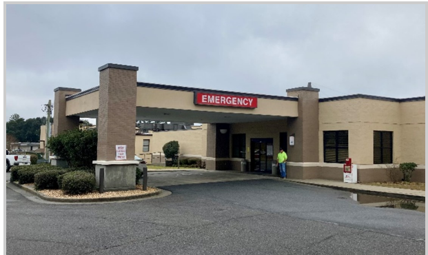
Pictured above is the newly-renovated entrance to the emergency department at Dodge County Hospital. The improvements provide a fresh outlook for patients visiting the Eastman hospital. The renovations were made possible with Rural Hospital Stabilization Program funding.

Even in the middle of the COVID-19 global pandemic, Dodge County Hospital forged ahead with renovations and projects that have sparked a positive, fresh outlook for both hospital staff and their patients in the small community of Eastman.