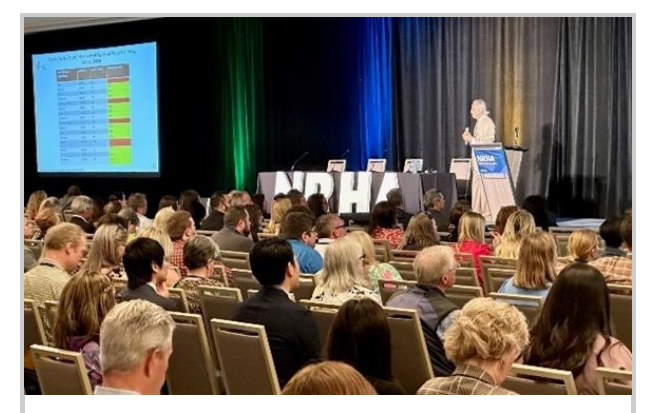
The National Rural Health Association (NRHA) hosted its 46h Annual Rural Health Conference in San Diego, CA, on May 16-19, 2023.

The National Rural Health Association (NRHA) hosted its 46th annual Rural Health Conference in San Diego, California, on May 16-19, 2023. The four-day conference centered on equity and transformation of healthcare systems and models in rural areas across the country. NRHA is a national nonprofit membership organization that provides leadership on rural health issues to thousands of members across the United States.